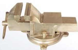
Parallel Vice 防爆台虎钳