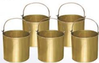
Wrench, Oil raisins 防爆水桶