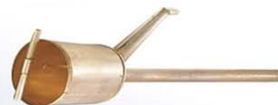
Portable Oil Pump 防爆提油泵