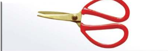
▷ Shears, Cutting 防爆剪刀