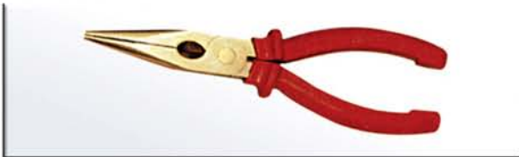
▷ Pliers, Snipe Nose 防爆尖嘴钳