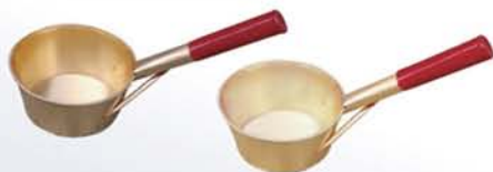
Wrench, C 防爆铜舀子