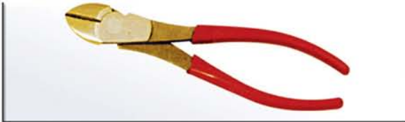
▷ Pliers, Diagonal Cutting 防爆斜口钳