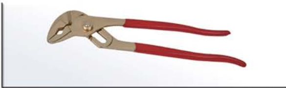
▷ Pliers, Groove Joint 防爆叠置式水泵钳