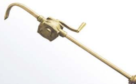
Manual Portable Oil Pump 防爆手摇油泵