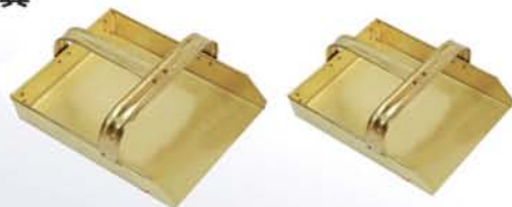
Wrench, dustpan 防爆簸箕