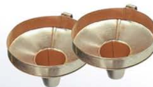
Oli Funnel 防爆油漏子